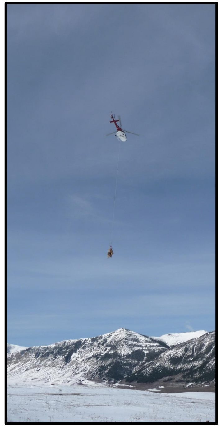
Figure 2: Road-killed ungulate carcasses are slung via helicopter each spring to remote areas.