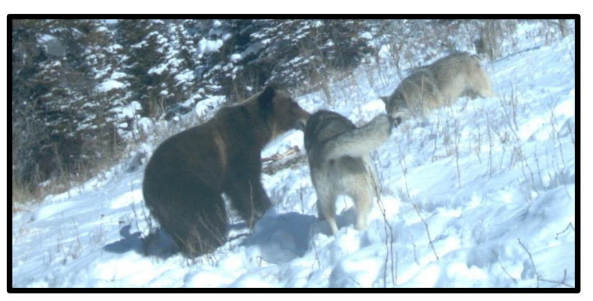
Figure 3: Although established for grizzly bears, other large carnivores such as wolves visit the feeding sites. Image from remote trail camera

PROJECT OVERVIEW: The propensity for conflict between grizzly bears (a provincially threatened species) and agricultural activities is high in southwestern Alberta, and various programs exist to mitigate these conflicts. Since 1998, ungulate carcasses have been placed in remote areas each spring to "intercept" bears upon den emergence to reduce spring depredation of cattle by grizzly bears. The overall goal of our research was to evaluate the efficacy of Alberta's intercept-feeding program by measuring use of program sites by bears, and by tracking trends in springtime grizzly bear-agricultural conflicts. We collected hair samples from bears using the intercept feeding sites each spring, and genetic analysis revealed species, sex, and individual identity. These results are integrated into a larger grizzly bear-livestock incidents through provincial conflict records.