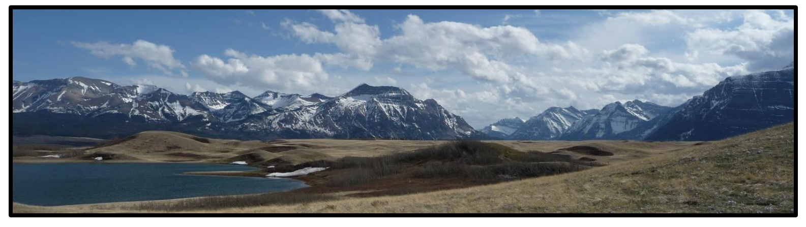
Figure 5: Southwestern Alberta landscape.

Figure 4: Map of study area in southwestern Alberta. Yellow triangles are the intercept feeding sites monitored in 2012 and 2013. The black crosses are the sampling stations from our larger non-invasive genetic grizzly bear monitoring program.