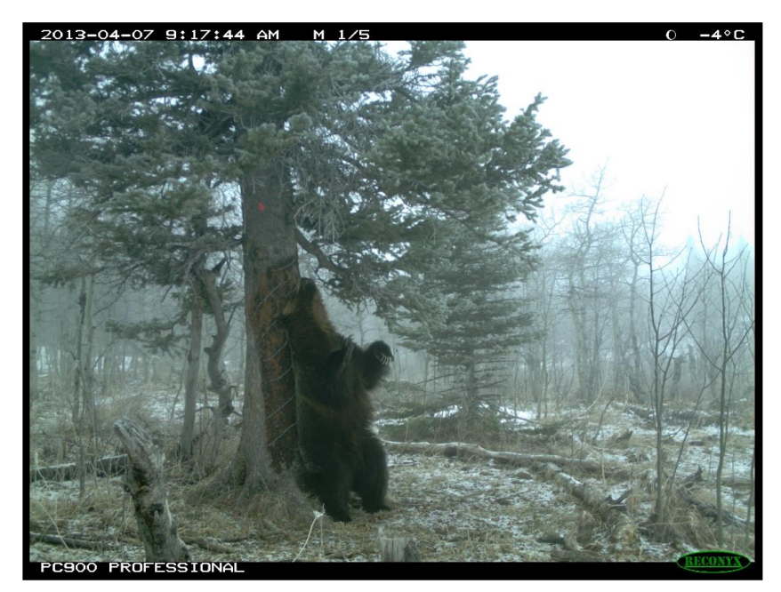
Figure 1: A grizzly bear rubs on one of our "WD 40 rub trees" at an intercept feeding site. Image from remote trail camera.

PROJECT OVERVIEW: The propensity for conflict between grizzly bears (a provincially threatened species) and agricultural activities is high in southwestern Alberta, and various programs exist to mitigate these conflicts. Since 1998, ungulate carcasses have been placed in remote areas each spring to "intercept" bears upon den emergence to reduce spring depredation of cattle by grizzly bears. The overall goal of our research was to evaluate the efficacy of Alberta's intercept-feeding program by measuring use of program sites by bears, and by tracking trends in springtime grizzly bear-agricultural conflicts. We collected hair samples from bears using the intercept feeding sites each spring, and genetic analysis revealed species, sex, and individual identity. These results are integrated into a larger grizzly bear-livestock incidents through provincial conflict records.